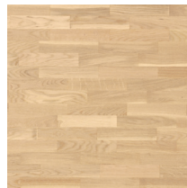
Oak Robust White