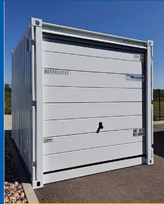
Practical sectional door