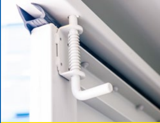
2 internal locks