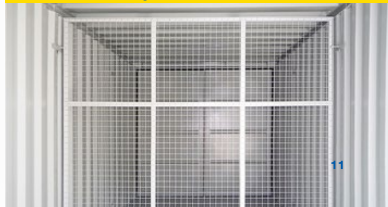
Partition grille with second double door